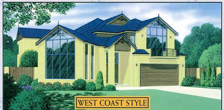
WEST COAST STYLE